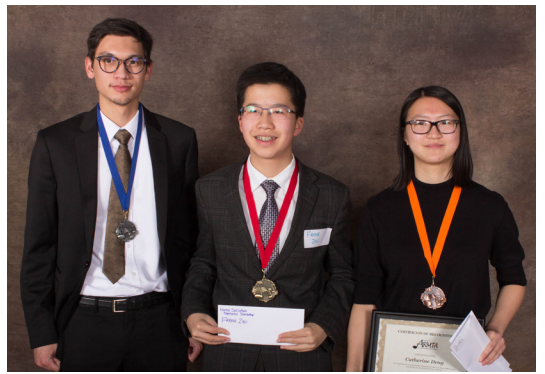
Voice Junior, PianoTen and ARCT