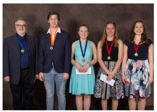
Voice Junior Two