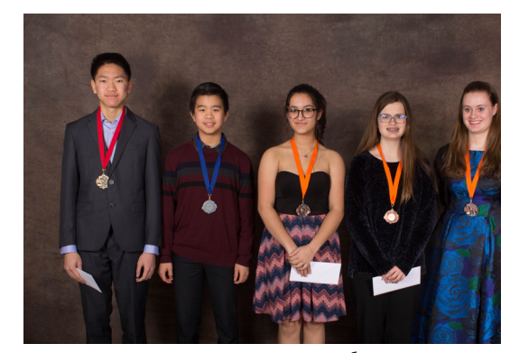
Voice Junior, Piano Intermediate